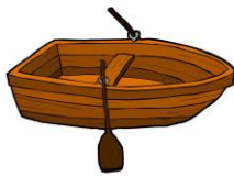
Group Row Your Boat