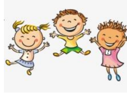
hands in the air