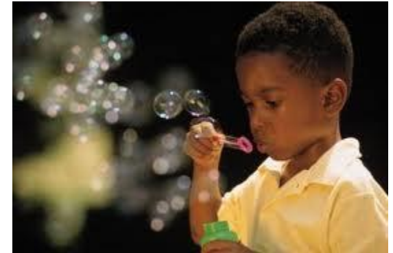
Sing Catch the bubbles