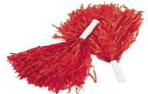
Sing Hurray Song (and pass the pom pom)