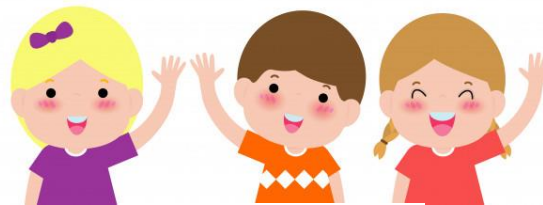
Wave hello and sing: "Hello everybody..."