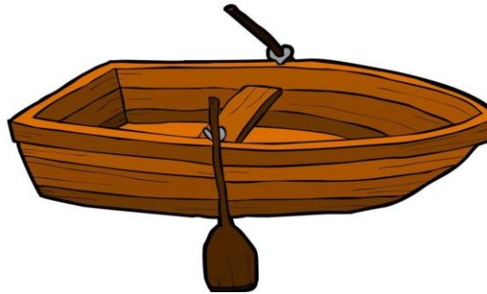
Group Row Your Boat: hold hands and sing